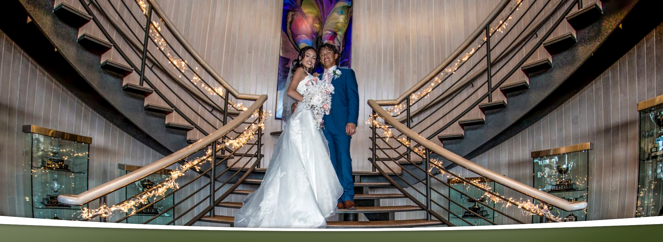
Create your dream... Inside and out!