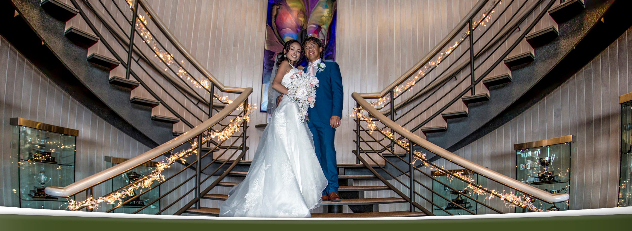
Create your dream... Inside and out!